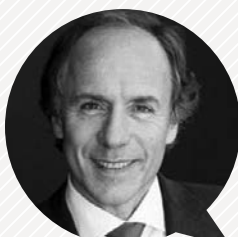
Dr Alan Finkel AO