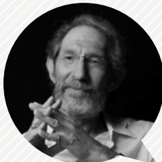
Professor Geoffrey West (USA)